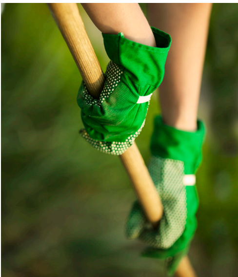
Start slowly and warm up for work in the yard and garden.

When you go outside, it may be for vigorous activities like gardening, raking leaves, pruning or shoveling snow in winter. To help prevent soreness and injury, make sure your muscles are warm. Wear layers and start your activities slowly, gradually stepping up the pace.